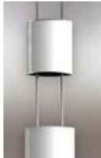
Ballast compartment for CMB, MPB and TMB options (finish matches mounting system)