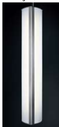
Edge Lit Trim