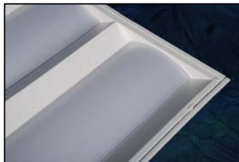
HIGH LIGHT TRANSMISSION FROSTED LENS (STANDARD)