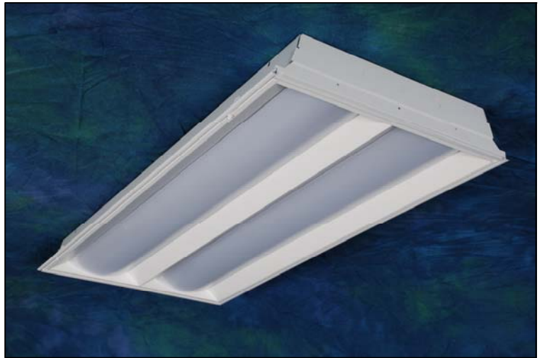
(Existing parabolic troffer retrofitted with Cynergy Kit shown)