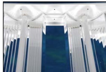
MULTI-FACETED REFLECTOR (DESIGNED FOR MAXIMUM EFFICIENCY)