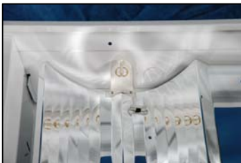
VOSSLOH LOCKING LAMP HOLDERS (STANDARD)