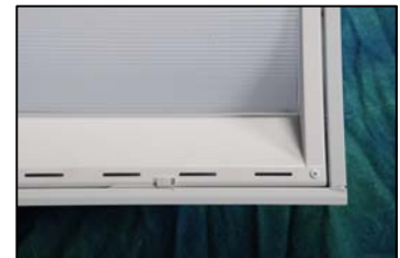
PRECISION FABRICATED FRAME ASSEMBLY (AIR RETURN SLOTS ARE OPTIONAL) (CUSTOM COLORS ARE OPTIONAL)

Note: RENOVA products are constantly being improved; therefore, the information shown is subject to change without notice. Always consult your lighting representative or RENOVA Lighting Systems, Inc. for the latest information.