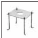
U109 BASE PLATE AND FIXING BOLTS