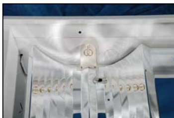
VOSSLOH LOCKING LAMPHOLDERS (STANDARD)