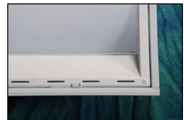
PRECISION FABRICATED FRAME ASSEMBLY (AIR RETURN SLOTS ARE OPTIONAL) (CUSTOM COLORS ARE OPTIONAL)

Note: RENOVA products are constantly being improved; therefore, the information shown is subject to change without notice. Always consult your lighting representative or RENOVA Lighting Systems, Inc. for the latest information.